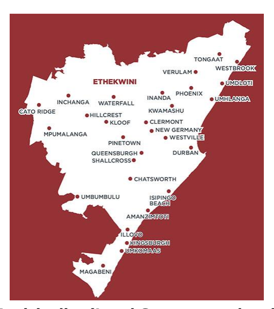
eThekwini Municipality (Local Government handbook, 2014)

eThekwini Metropolitan Municipality (eThekwini Municipality) is one of eight Category A municipalities in South Africa, and one of 11 districts in KwaZulu-Natal. eThekwini Municipality is bordered in the north by the Ilembe District Municipality, to the east by the Indian Ocean, to the south by the Ugu and the Umgungundlovu District Municipalities. It stretches beyond Umkomaas in the south to the Tongaat River in the north, and to Cato Ridge in the west. The central parts are urbanised and include the CBD, the Port of Durban, the industrialised South Durban Basin (SDB) and commercial and residential areas. The outer areas are less populated and include a mix of growing industrial activities (at Umkomaas, Cato Ridge, and the Dube Trade Port), agricultural areas (including sugar cane), and natural areas.